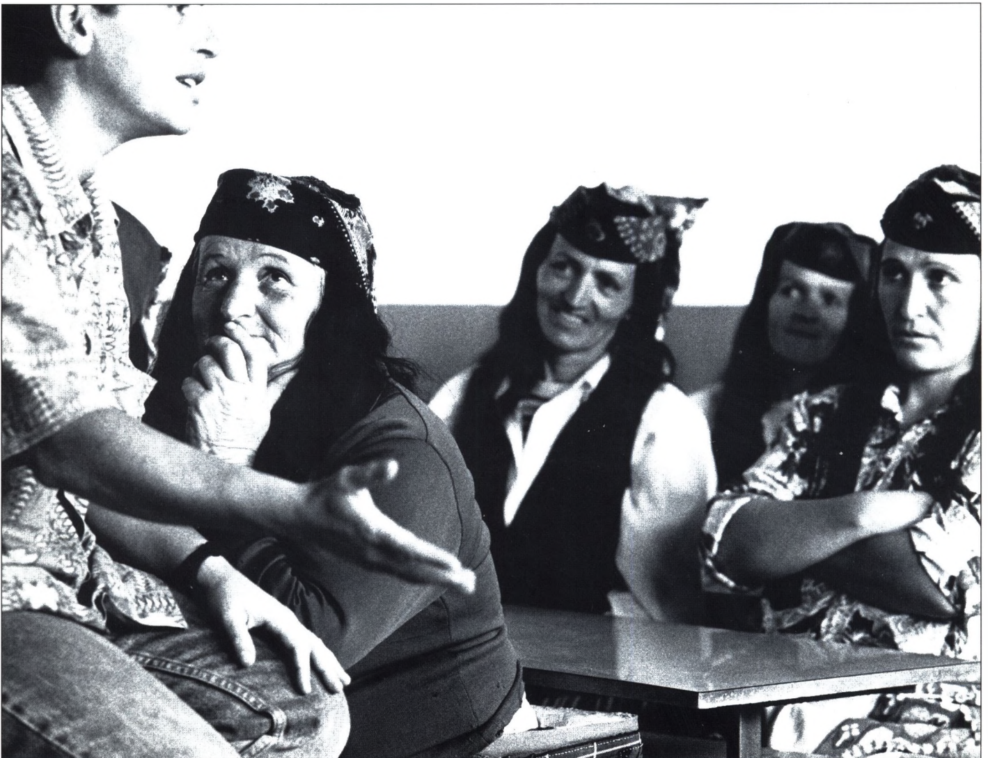
Kosovo/a, Serbia. Albanian women's group meeting in Has.

Above all it was felt to be essential that training at one level was linked to action at the other levels, so that the participants at regional and international training events could bring their experience of training and working on minority issues to those meetings. Conversely, what is learned at the international or regional level could also be used at the local level. This could imply a tension between the universal and the particular, but it was felt that such a tension would be creative rather than destructive.